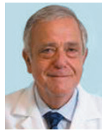
Mass General for Children

New patients 888-644-3248 Established patients 617-726-3826 Fax 617-643-9643