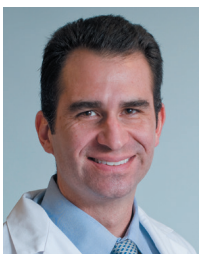
Mass General for Children