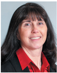
Mass General for Children