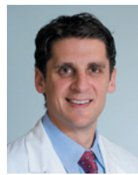
Mass General for Children